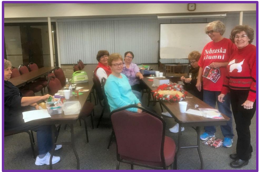
Above: Creative Crafters meet once a month to create handmade greeting cards, bizarre items & tie quilts for charities.