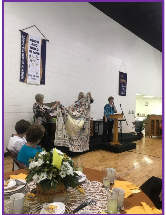
Spring Luncheon and Quilt Show 2017